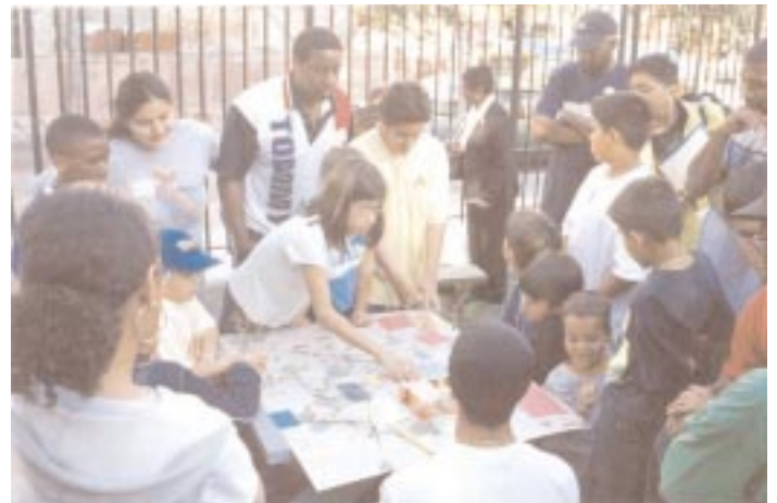
Kids, teenagers and adults discuss ideas at a Participatory Design Festival held at LES Park.