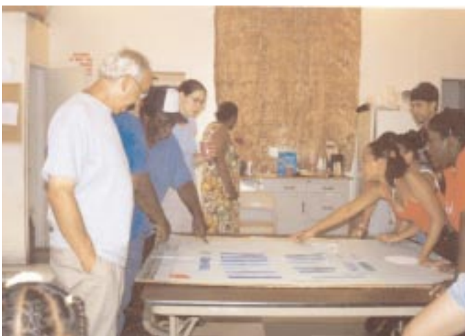
Garden members of all ages negotiate over new garden designs at Granite St Garden.

The PD Festival is held on the first Saturday of every month at LES Park, a one acre garden, park and playground located at 11th Street between 1st Ave. and Ave. A, in Manhattan. LES Park emerged from the team efforts of kids, adults and teenagers through Participatory Design, in 1990. Coming Spring 2002, PD festivals will be held in Harlem, the Bronx, and Brooklyn, co-hosted by GreenThumb and school-led community gardens. The next PD festival will be held on Saturday, February 2, at LES Park. No pre-registration is necessary. If you would like to learn more about Open Road, contact them at OpenRoadNY@aol.com .