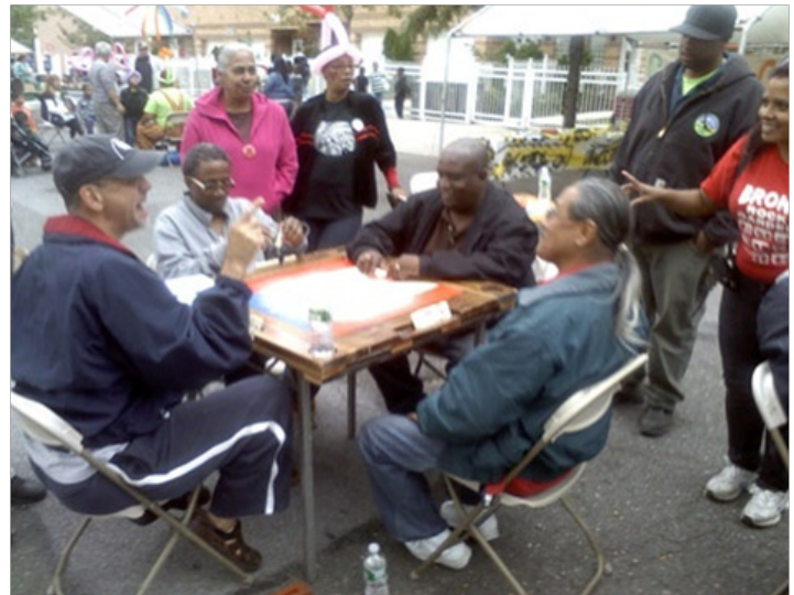
Bronx Rock Garden vs. EL Flamboyan Community Garden, Domino Tournament At 2011 Harvest Fair.